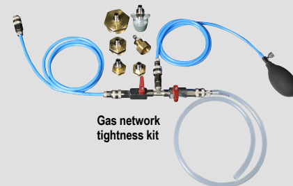
Gas network tightness kit

1 Please see the technical datasheet of accessories for kigaz for further details